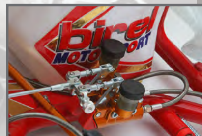
Reservoir-style master cylinders

- Chassis pictured with optional side pods