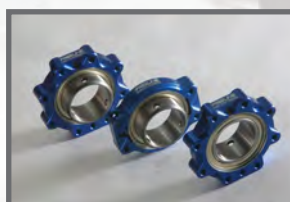
Re-designed bearing cassettes

- Chassis pictured with optional side pods