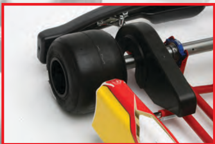
Freeline removable chain-guard comes standard