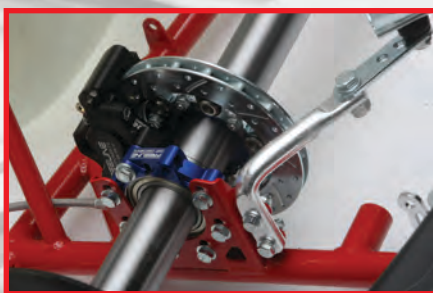
Self-adjusting brakes with cross-drilled & floating vented rotor

The 2013 RY30-S5 is the latest version of one of Birel's most successful and versatile racing models, collecting wins in both Junior & Senior categories and multiple engine classes. The RY30 is loaded with standard features including a Freeline removable chain-guard, all-new "Motorsport" graphics kit and steering wheel. The RY30 is now available from your nearest MRP/Birel dealer. For more information, visit www.BirelAmerica.com .